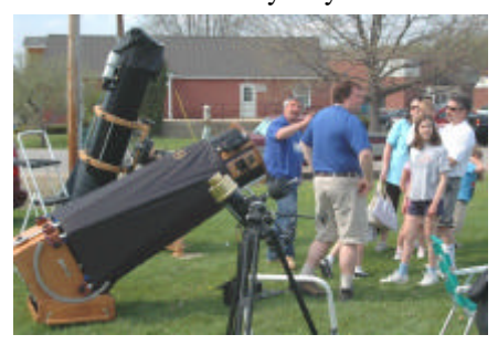
(See Astronomy Day, page 2)

As the sky darkened and visitors exited the planetarium shows, we were able to amaze them with up close views of the Moon, Venus, Jupiter, Saturn, and an occasional quickie explanation of how to measure distances in the sky by using your hands. By 9:30 p.m., all the visitors had left. We packed up and thus ended Astronomy Day 2004.