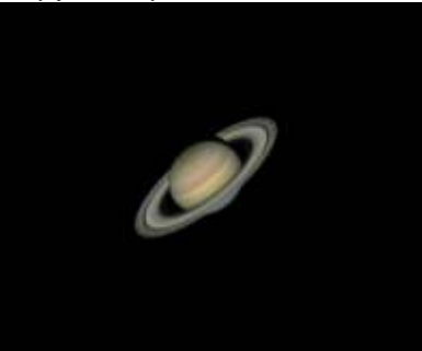
I didn't have my camera with me at the Bow skywatch to take advantage of the incredible seeing we had that night. The views through my 11" Starmaster ELT and Nil's 8"

* Gardner Gerry Here are the editor's picks for photos of the month. The good news is that there are a ton of pictures on the website keeping me busy for many months ©