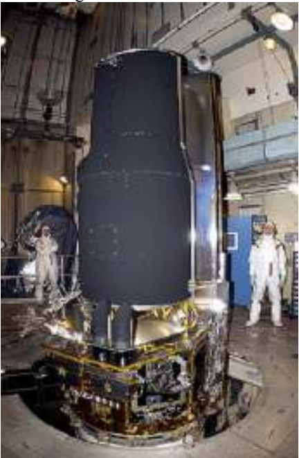
The goal is to measure the star formation rates in three different galaxy clusters each at different red shifts, thus distances away and thus also age. They are looking to see if there was a time of maximum star formation in the universe's history, and if nature vs. nurture is the cause for what we see in galaxy shapes and types. Another aspect of the project relates to the public outreach. Much of this work

John is working with scientists and other teachers on a project using the Spitzer Space Telescope (IR astronomy). The scope itself is in orbit and is cooled to be very cold to obtain better images.