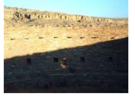
We were treated to a wonderful presentation and slide show upon their return. NHAS member John Blackwell also spent several months in Arizona doing research.