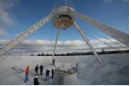
Photo by Dave Weaver This gives some perspective on just how big it really is. Finally, the team got a nice shot from inside just before going onto the dish.

Photo by Dave Weaver They had a wonderful tour including the opportunity to go onto the actual dish itself.