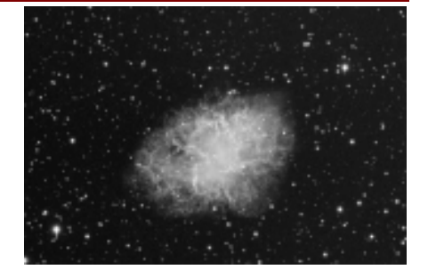
14" LX200R, FLI PDF, FLI CFW2-7, Astrodon filters, Optec Pyxis, SBIG ST-10XME. Acquisition with CCDAutoPilot3, calibration with CCDStack.

I've only just begun on M1, but I thought I share this single frame now from a night of superb seeing (11/10). This is a single 30m red exposure calibrated (dark subtracted and flatted), but no further processing.