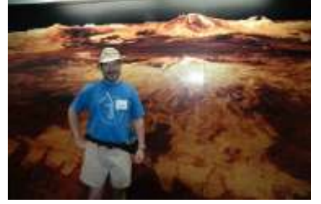
While there, he was able to get a tour of giant mirror facility.