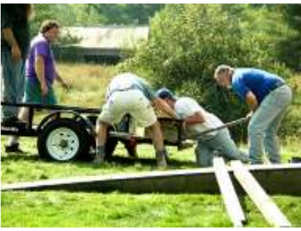
Photo by Chase McNiss The last few years has also seen NHAS expand out of the traditional visual Astronomy range into the world of

Photo by Chase McNiss Speaking of maintenance, what would be a YFOS work session without some rock removal. The September 06 work party was not a disappointment.