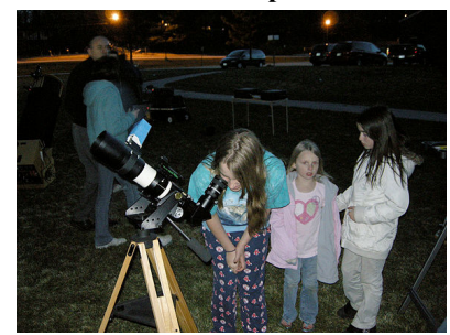
TeleVue 75mm observing

Sky conditions were not as good as the previous evening, and the site has horrific light pollution due to floodlights in an adjacent public park, but about 50 students and their families were treated to the planets Saturn and Mercury (visible just above the horizon at twilight), the Pleiades, the Orion nebula, clusters M35 and M37, M3, and galaxies M81 and M82.