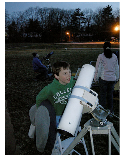
Young observer at the Los scope

Transparency and seeing were both good. We had twelve telescopes and needed all of them, as attendance (50 from Mastricola, 100 from Thornton's Ferry) exceeded expectations.