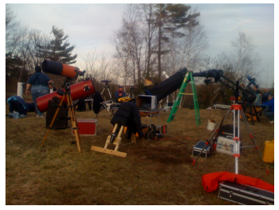
MM Observing Field (Paul Cezanne photo)

I made the almost 5 hour drive north to New Boston to both look at the sky, but more importantly, meet up with all my old friends.