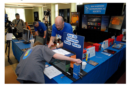
Some of the donated raffle items. Proceeds to benefit the NHAS educational outreach program.

Chase explains how telescopes work. In the background is the astrophoto exhibit.