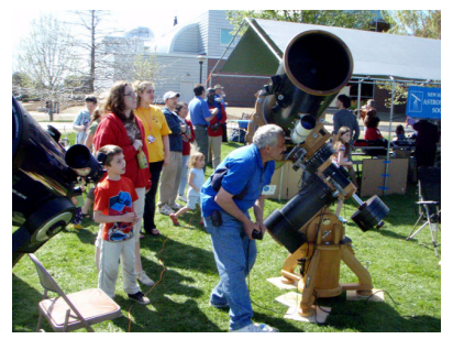
Rich Schueller demonstrates telescopic magnification.

Joe Derek lines up the Moon in his 12.5" reflector.