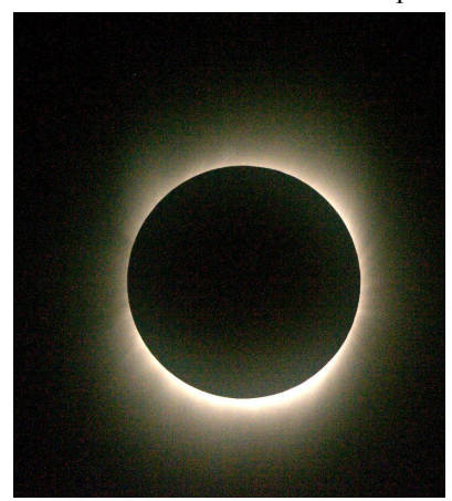
You can see this and other wonderful photos of their trip at <a href="http://www.mv.com/users/lopez/200">http://www.mv.com/users/lopez/200</a> 9 China Eclipse/ .

Larry and Linda Lopez traveled to China to view the total solar eclipse.