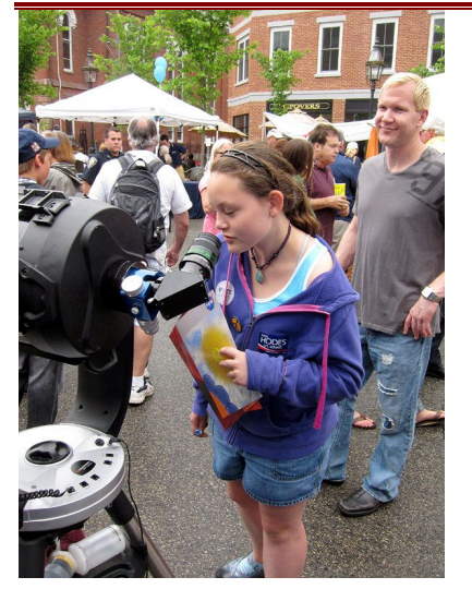
Soulshine is happier uncovered, and viewing a distant flagpole, once the rain stopped.