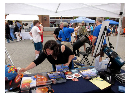
One of the passers-by avails herself of our literature on solar observing.