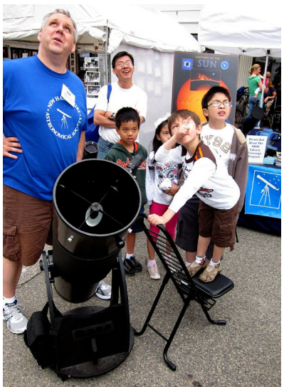
Yes—that's really what you're seeing in the scope!

I spoke to several educators and librarians who were very interested in our public outreach programs, especially the library telescopes. I also had several members of the public ask me where the nearest public library with a loaner scope was. We need to have a list of