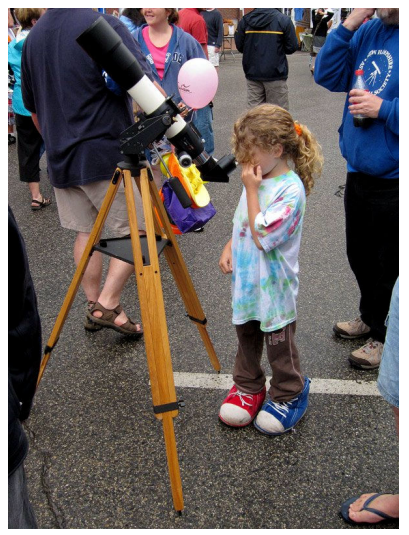
Observing the church steeple clock tower through the TeleVue 85mm Refractor.

Once the weather cleared, I had my 85mm TeleVue refractor focused on the same object.