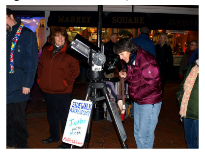
Jupiter in Market Square

stole the show. In fact, with a few colored lights it could have easily been mistaken for a second Christmas tree. (Note to Rich: red lights would work best).