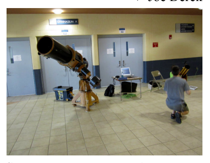
Set up and ready to go