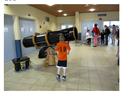
Now THAT's an equatorial mount!