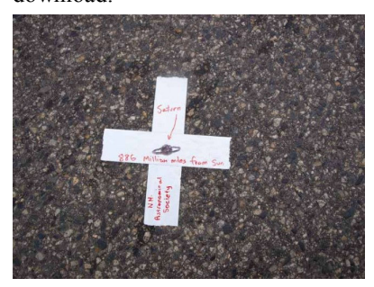
Saturn's marker on the Solar System Scavenger Hunt.

We handed out many reprints on Astronomy and the Moon, and many other pieces of literature. I put together a list of upcoming public observing events for the rest of 2011 for NHAS, UNH, ASNNE and NSAAC and many people took copies of this. (There were over 60 events listed.) We can put a copy of this on the web site for people to download.