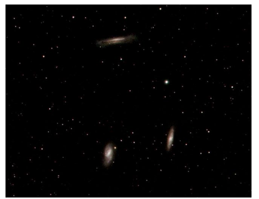
The Leo Trio

The truly impressive aspect of the triple conjunction was the elevation of Mercury, aided in part by the ecliptic being at an almost 45° angle. Mercury could be observed for more than an hour after detection.