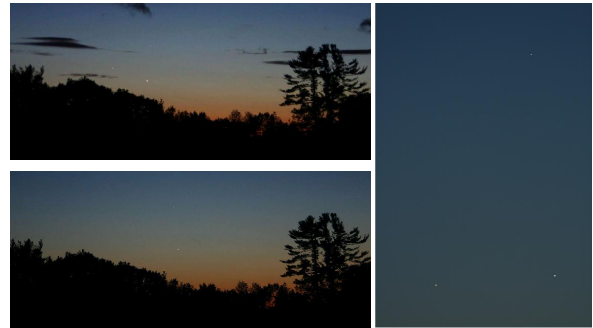
From atop a hill in Epping NH, an almost equilateral triangle was seen on May 26 (top), but the next day it had been transformed into a right-angled triangle. Mercury at the top, Jupiter and Venus as base.

The last week of the month threw up a marvelous triple conjunction of Mercury, Venus and Jupiter. With the 2 inner planets heading for greatest elongation and Jupiter heading toward a conjunction with the Sun, we witnessed the trio form a multitude of triangles and then go back to being a stretched out like a string above the western horizon. The configurations on the evenings of May 26 and May 27 are shown below: