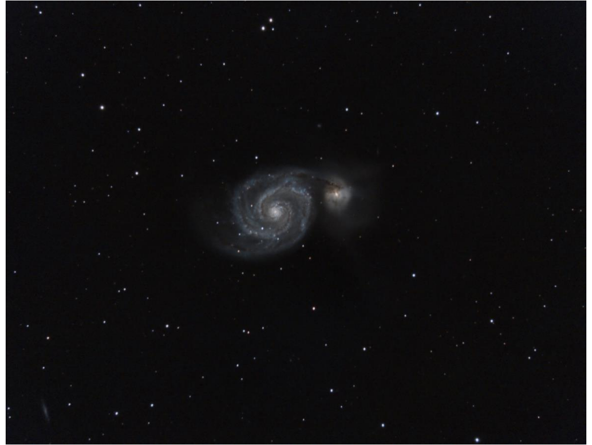
The Whirlpool Galaxy in Canes Venatici, discovered by Charles Messier in 1773 and designated M51, interacting with a companion galaxy NGC 5195. Distance estimates had placed it in the range of 15 to 35 million light-years, but the Type II-P supernova SN 2005cs gives an estimate of 23 \pm 4 MLy. The cigar-shaped edge-on galaxy at the bottom-left corner is IC 4263. (Image: Gardner Gerry, C9.25 @ f/6.3 with QHY9C (-25°C), 37 x 300 sec stacked)