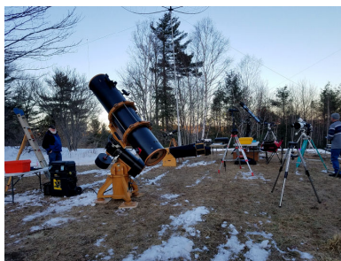
Messier Marathon observing field