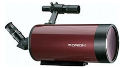
Orion Apex 127mm Maksutov