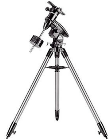
Orion Skyview Pro