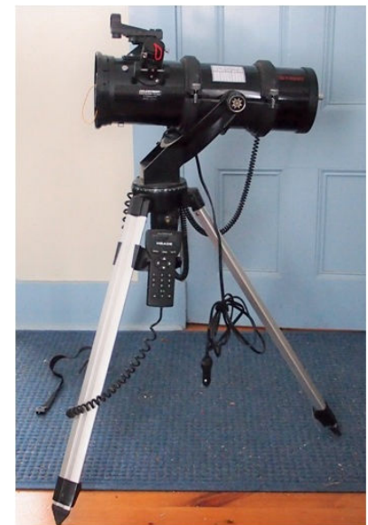
Celestron Firstscope 114mm

All of these scopes are available for members to take home and use.