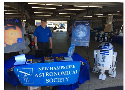
R2D2 visits the NHAS booth.