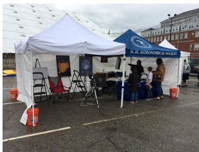
The NHAS booth at Children's Day.