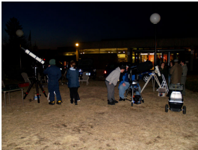
The observing field