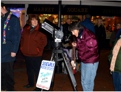
Jupiter in Market Square

stole the show. In fact, with a few colored lights it could have easily been mistaken for a second Christmas tree. (Note to Rich: red lights would work best).