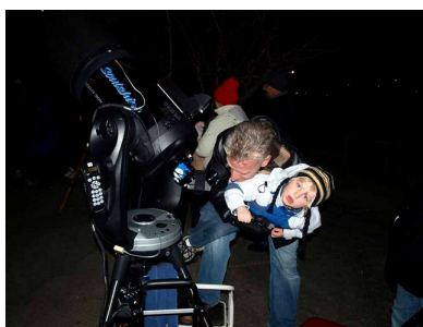
And now it's dad's turn....