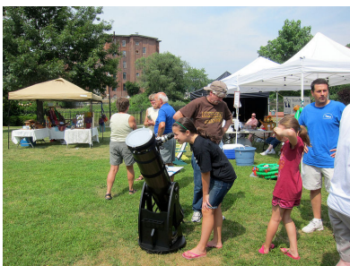
White light solar observing