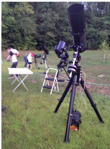
A SCT roundup. Front to back 9.25", 11", 8", 6"

We made sure everyone could see Saturn, giving those who needed some time at the eyepiece a while so everyone was convinced they saw it. I went on to Alcor and Mizar, Albireo, M13, and NCG457 with a C-6 on a tripod at 43X.