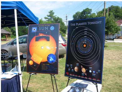
Our dioramas